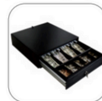
JAW-400DK Bill and Coin Optional Automatically Open