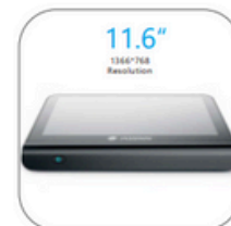
11.6 inch TFT LED Backlight Projective Capacitive Touch Screen