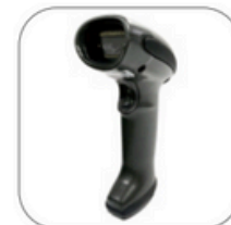
JAW-6208 1D/2D Scanner 617nm LED Aimer, White LED