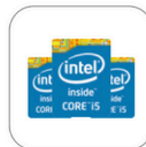
Intel SoC Bay Trail J1900 Quad Core Processor