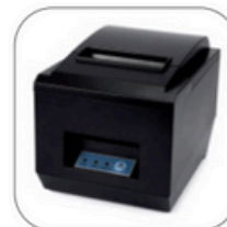
JAW-8250 58/80MM Thermal Printer