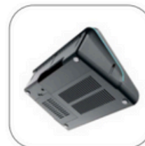
ODM Service for color line